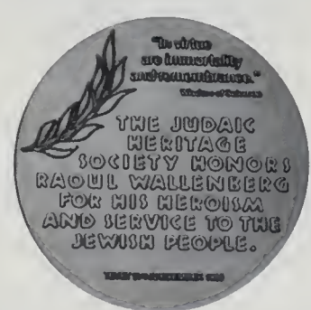
Lot No. 2535